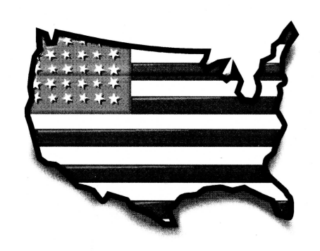
Figure out the name of the state from the scrambled letters: